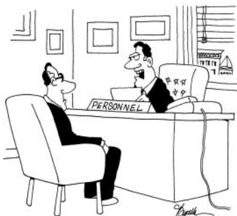
“Sorry, we just filled our ‘Financial Analyst’ position, but we do have an opening in ‘Sacrificial Lambs.’”

Are Digital Devices Dumbing Us Down? .....Page 4