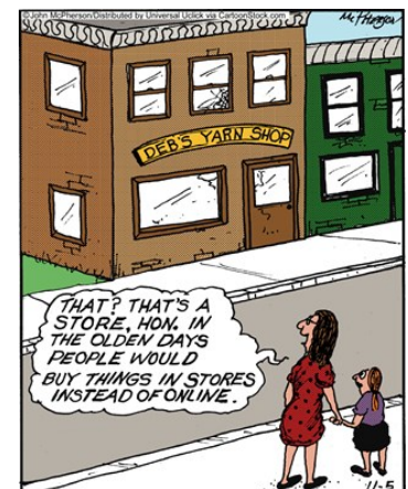
In the year 2030.