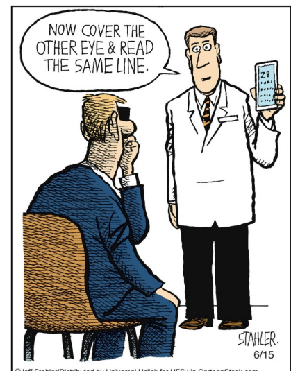
©Jeff Stahl/Distributed by Universal Uclick for UFS via CartoonStock.com